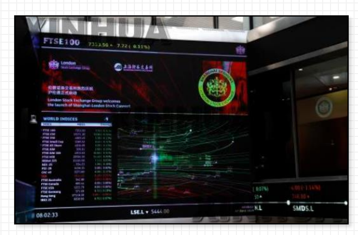
London Stock Exchange